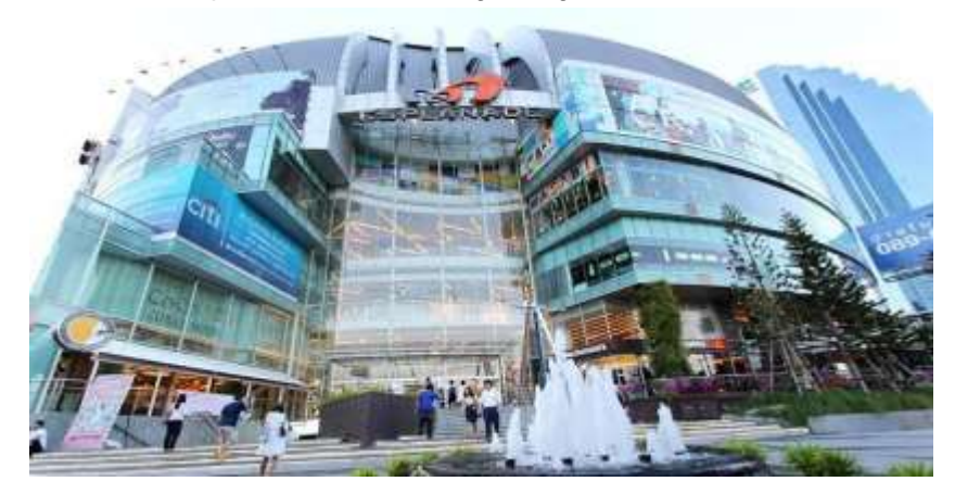
Location: 99 Ratchadaphisek Rd, Din Daeng, Bangkok 10400

The Street Mall – This is a 24-hour lifestyle complex consisting of numerous stalls selling fashion, apparel, cosmetics along with extensive dining options. The Street also has many 24-hour cafés and restaurants as well along with a 24-hour fitness gymlocated at the 2<sup>nd</sup> floor. Location: 139 Ratchadaphisek Rd, Din Daeng, Bangkok 10400